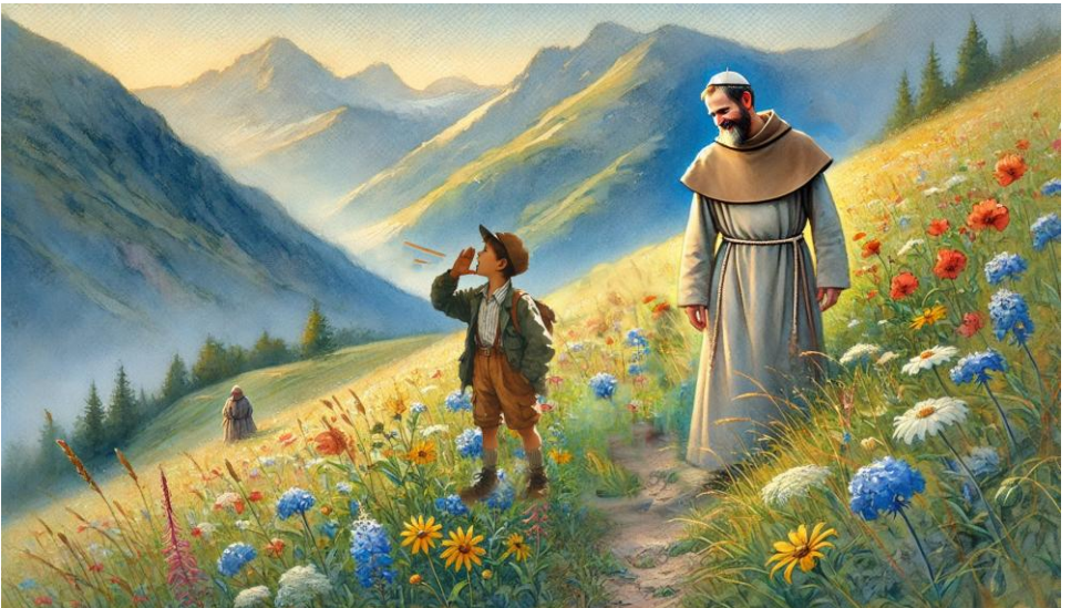
3:17 be the echo...