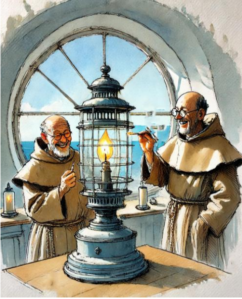
3:8 lamp at noon...